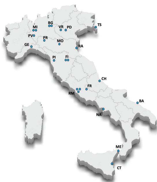
Figure 1. Geographic distribution of participating centers.

191 out of 207 patients (92.3%) were sensitized to aeroallergens: the most prevalent were dust mites (89.5%), followed by grasses (52.9%) and pets (51.8%) ( Table 1 );